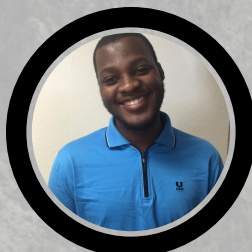
14 - LETHABO