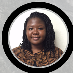
7 - MOSIDI