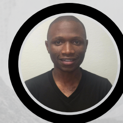
11 - SEABREEZE