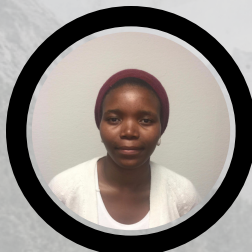
8 - MODIEGI