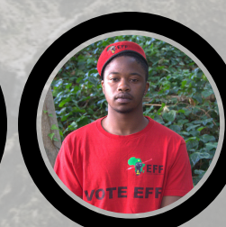
25 - NSOVO