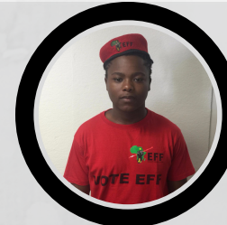
5 - SIBONISE