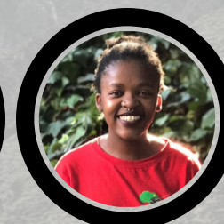
15 - NALEDI