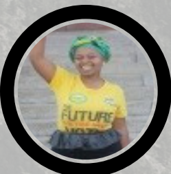
13 - NALEDI