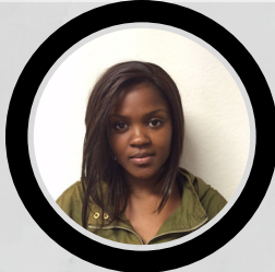
3 - TABILE