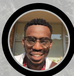
16 - THANDANI