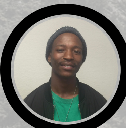
22 - PHAKAMANI