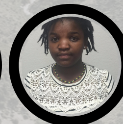
19 - KHULULWA