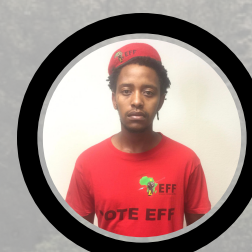
26 - SINAWO