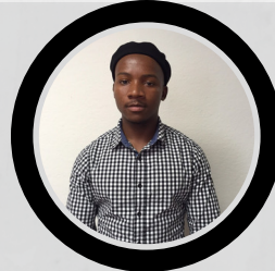
4 - ZUKO