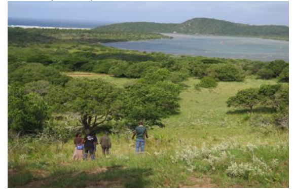
The Kosi Bay system, including fish traps