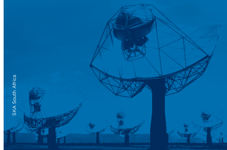
SKA South Africa

The SKA project is an international effort to build the world's largest radio telescope. The telescope will be co-located in Africa and Australia. UCT is playing a leading role in a flagship programme that will create data science capacity for leadership in the MeerKAT SKA precursor survey projects, other global precursor and pathfinder programmes, and SKA key science.