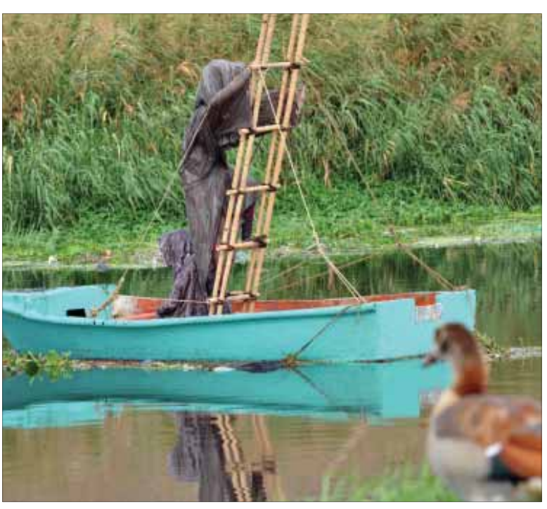
Turning the tide: A representation of the Grim Reaper warns the public of the plight of the Black River.