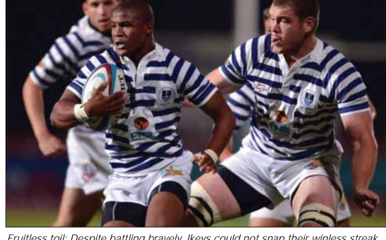
Fruitless toil: Despite battling bravely, Ikeys could not snap their winless streak against arch-rivals FNB Maties in the fifth round of the FNB Varsity Cup.

Ikeys exploited their newfound momentum and bludgeoned the Maties