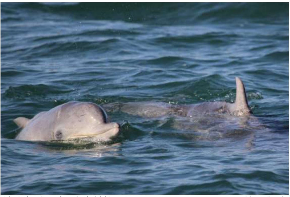
The Indian Ocean humpback dolphin.