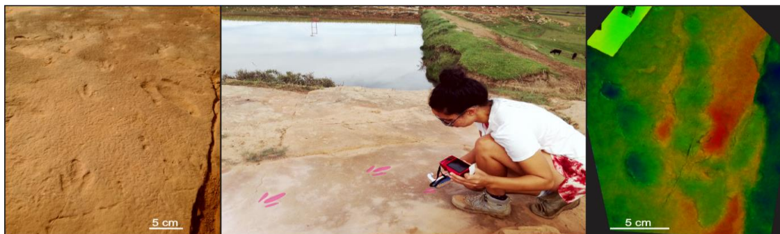
Theropod tracks in the Elliot Formation (left) with a colour-mapped model of an individual track (right).

When I stand in my study area, the vibrant maroon-red rocks of the Elliot formation, I can time travel to ~200 million years ago when dinosaurs roamed the earth, rivers and flash-flooding dominated the landscape and the climate was aridifying ... Sometimes I even skip a few pages ahead and glean snapshots of when dinosaurs were walking in little pools of water during desert-like conditions, or extensive outpourings of lava were burying southern Africa.